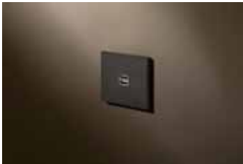
USB supply unit 2A Sn0114