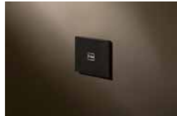
USB supply unit 2A Sn0118