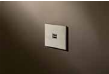
USB supply unit 2A Sn0101