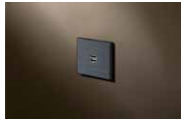
USB supply unit 2A Sn0103