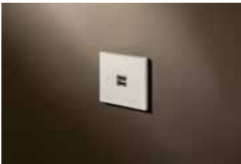
USB supply unit 2A Sn0113