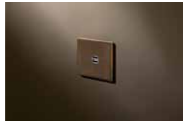
USB supply unit 2A Sn0117